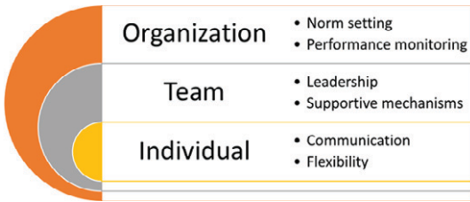
Figure 1. Multilevel themes to better support virtual team's rapid deployment.

processes in place to monitor performance. Monitoring performance in a virtual team can manifest in various forms. Best practices for virtual teams suggest that team performance can be monitored through the use of technology (Malhotra et al., 2007). Information exchange through electronic discussions, emails, and other team archives can be monitored to assess team members' contributions and performance (Kirkman et al., 2002). The literature suggests that to monitor performance and ensure team members are staying on track with goal progression, team leaders can perform routine check-ins (Bates, 2020). However, performance monitoring is more successful when consistent across the organization, providing employees with a sense of stability and continuity in the middle of such chaotic and uncertain times.