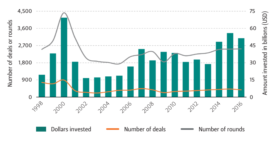
FIGURE 4 - U.S. NATIONAL TRANSACTIONAL VENTURE CAPITAL