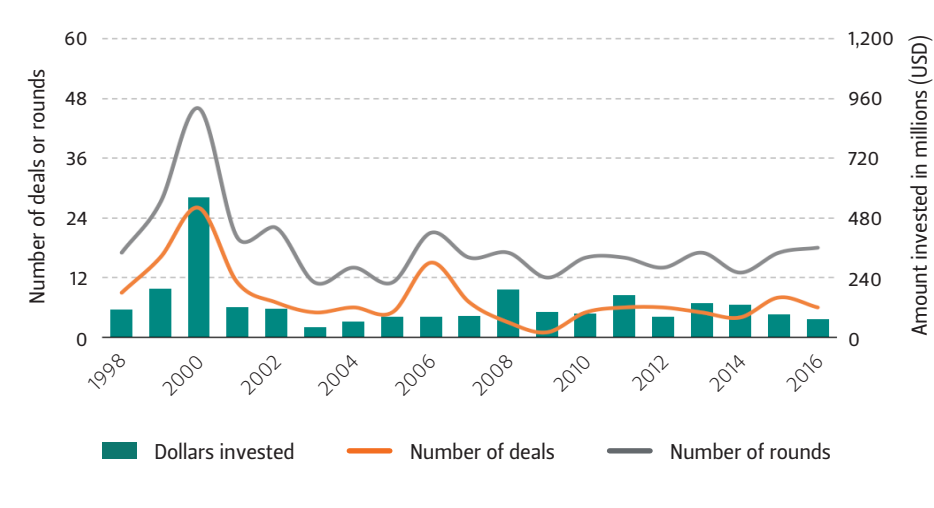
FIGURE 3 — HOUSTON GROWTH VENTURE CAPITAL