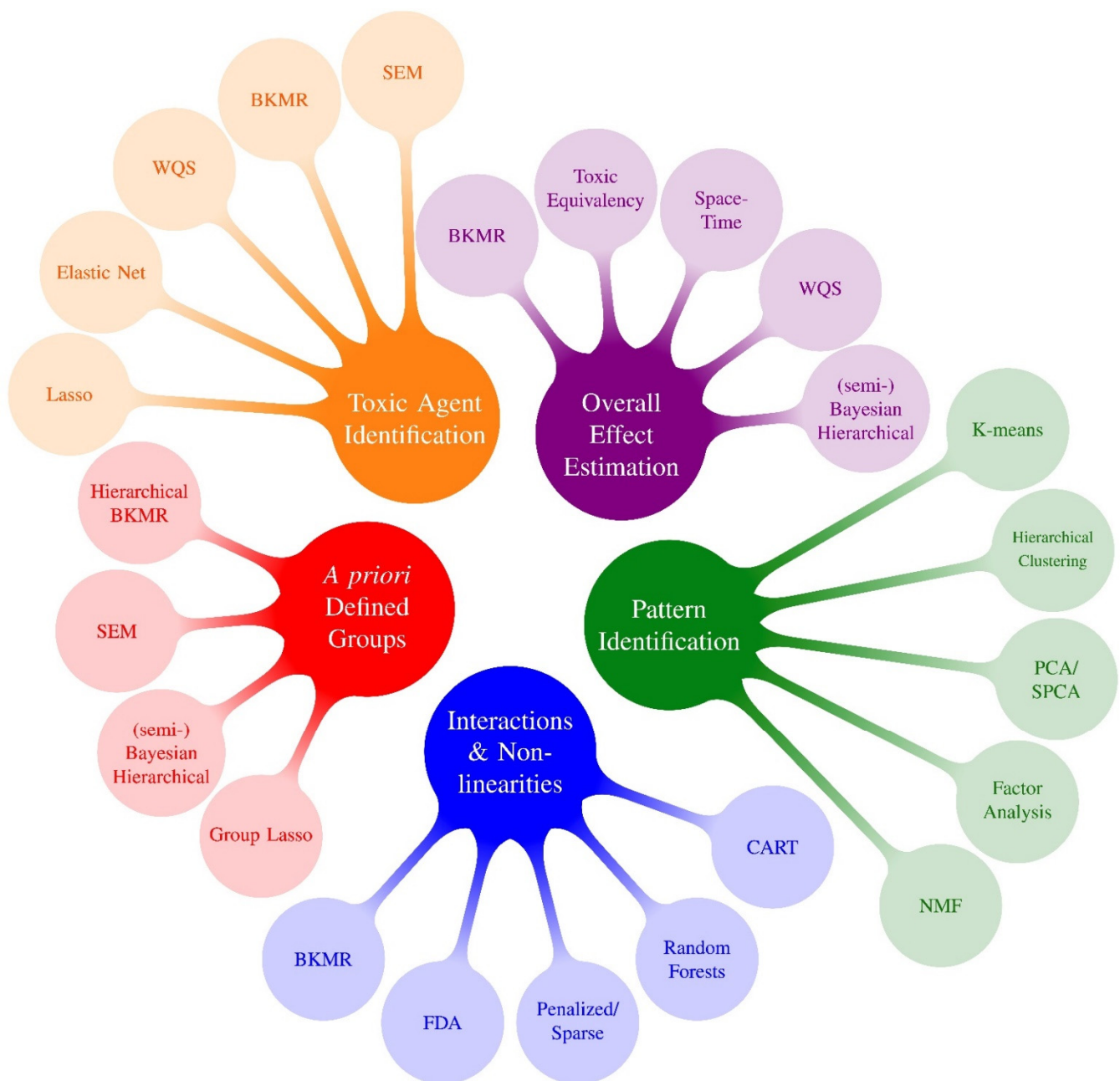
Figure 1. Mixtures Methods x Research Questions 1 : Methods Preceding PRIME. 1 Research questions following Gibson et al., 2019 review: (1) Overall effect estimation: What is the overall effect of the mixture and what is the magnitude of association? (2) Toxic agent identification: Which congeners or chemicals are associated with the outcome? What congeners/chemicals are most important? (3) Pattern identification: Are there specific exposure patterns in the data? (4) A priori defined groups: What are the associations between an outcome and a priori defined groups of exposures? (5) Interactions and non-linearities: Are there interactions between exposures? Is the exposure-response surface non-linear? (6) Exposure-response relationship: What is the exposure-response relationship between each chemical and the outcome? Because almost all methods that investigate interactions also characterize potentially nonlinear exposure-response functions, we group questions #5 and #6 into a single bubble in this figure.